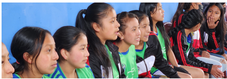
The girls' soccer team

While your financial support has kept the school doors open, your moral support has kept me going. I want to thank you for both.