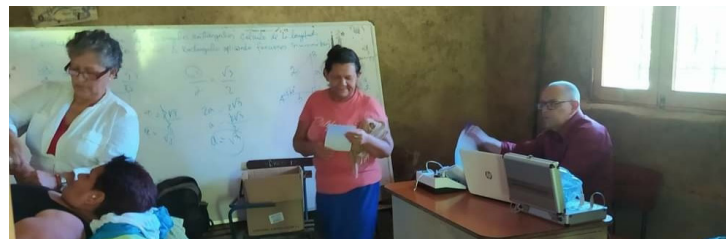
Christine King Cooperative provides alternative health care services to Jiñocuaao community members

Some exchanges involve providing services to community members. The Christine King Cooperative has travelled to several communities, including Jiñocuaao, to provide natural medicine services (a program Casa contributed to last year). In some communities they also provide some training to local health-care professionals.