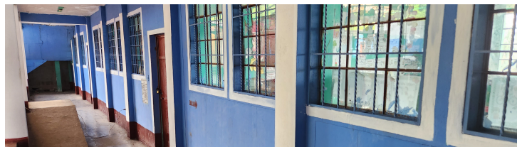
El Triunfo School with new windows and blue paint

On my visits to the school, I was pleased to notice that the building was back in a good state of repair. Broken windows in the classrooms were fixed and a new bright blue paint job was in the process of being finished. In addition to taking part in the festivities, I was also able to meet with the school and community leaders and get caught up on the paperwork. Thank you for your continued and valued support; the running of the school is not possible without it.