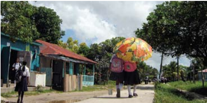
Students walk home from school in Pearl Lagoon