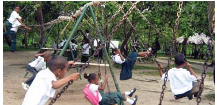
Students play in at the Pearl Lagoon Academy of Excellence

We are proud to announce that the “Model for Bilingual Education and Successful Teaching” project, called My BEST for short, has been approved by the Canadian International Development Agency (CIDA).