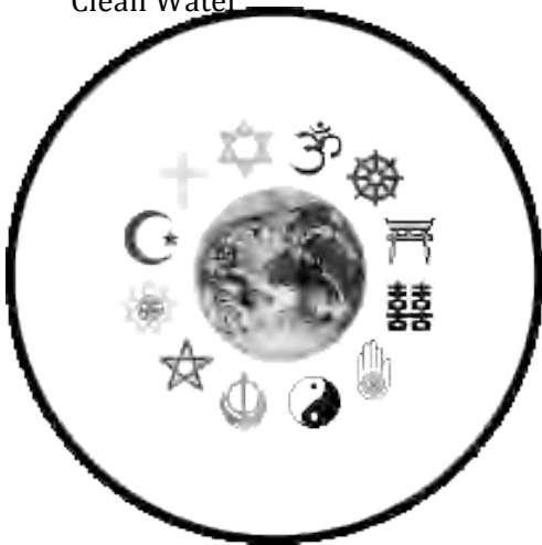
Religious and cultural freedom