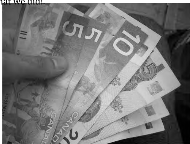
Extra Money to Spend